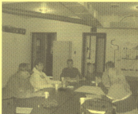
Community members get together for coffee and conversation at the AMD&ART Education Center.

The VBPC and local residents are working together to address a number of concerns recently identified within the community. Using the 2001 Community Vision Plan as a catalyst, the VBPC hopes to promote desired land uses. One important land use project in Vintondale is the AMD&ART Park. The VBPC and Vintondale residents of all ages are making plans for a community parade to celebrate the completion of Vintondale's AMD&ART Park on July 9, 2005. Bring the family and experience Vintondale's AMD&ART Park for yourselves...see first hand what multi-disciplinary collaboration and community engagement can do with an idea, a vision and purpose.