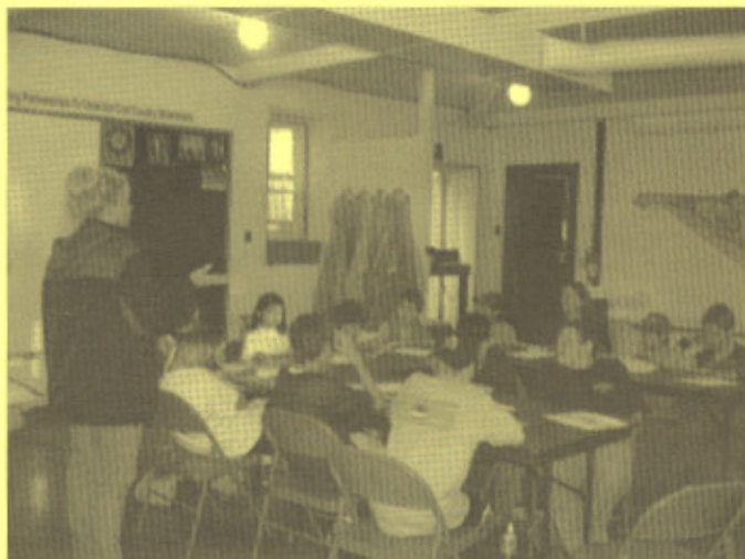
Vintondale youth attend a Parks and Recreation Workshop at the AMD&ART Education Center. Local youth spent 1-1/2 hours assessing the condition of the Maple Street and 6 th Street Parks and gave their ideas for improvements. All attendees participated in designing parade floats, these designs are on display in the AMD&ART Education Center.