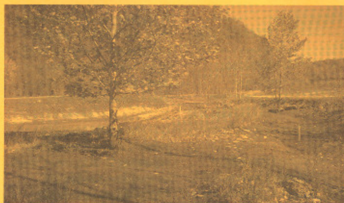
A shot of the Vintondale wetlands (after excavation) which will be planted in spring.

Funds are still needed. If you would like to make a contribution or memorial donation to the Vintondale Wetland Fund please contact the AMD&ART office at (814) 539-5357.